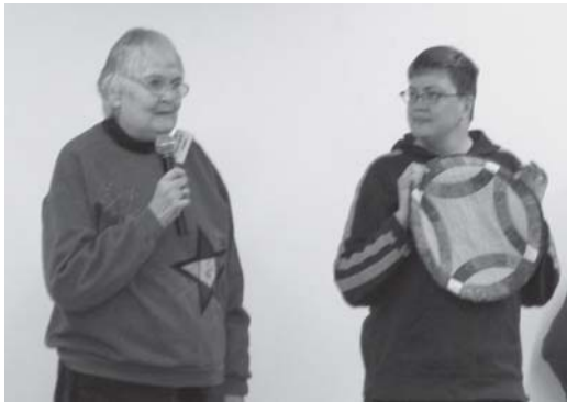
The first small quilt donation.

For more information and an application form contact info@textilecentermn.org , call 612-436-0464 or visit www.textilecentermn.org .