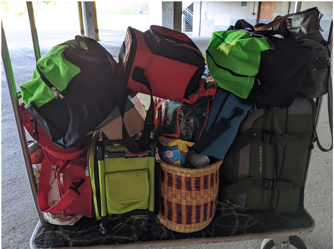
Yup, this is what our 'luggage' looks like when we get to the hotel! Note the green duffel bags!