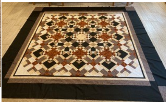
▼ Sharon Detert's 2024 Mystery quilt top.