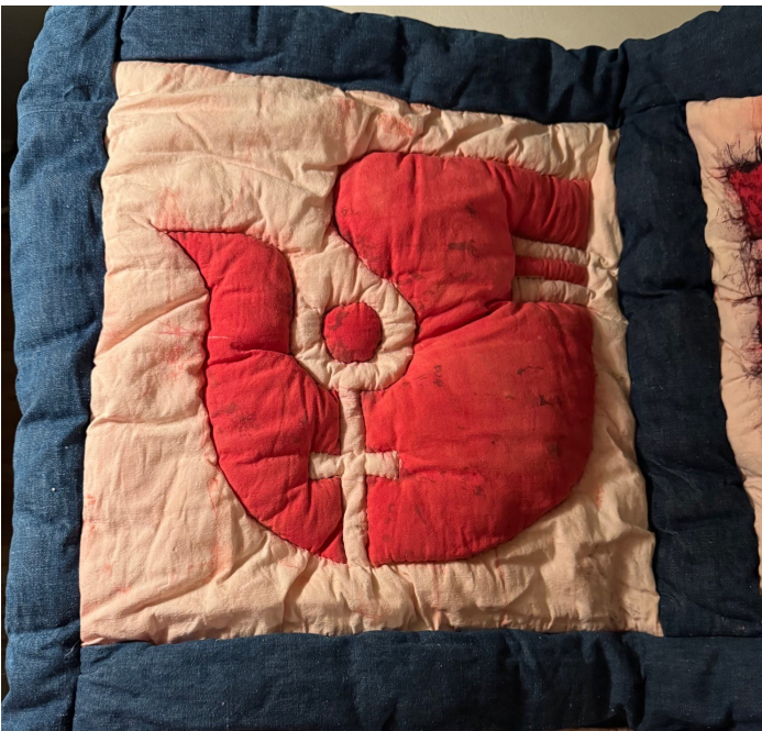
Quilt block for 1975 International Year of the Woman.