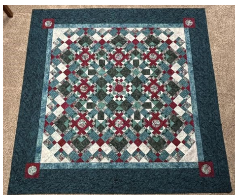
▲ Nancy Drake's 2024 Mystery quilt top.

The 2024 Mystery Quilt has completed (pictures below) and those registrants also get to enter their completed quilt into The Minnesota Quilt Show this June.