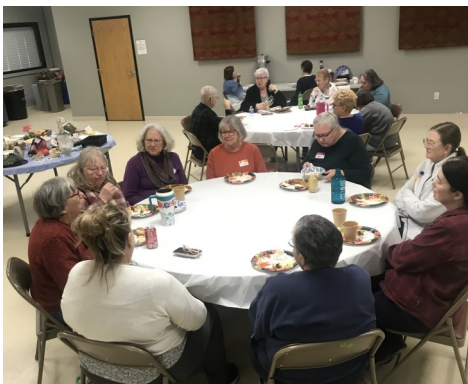
Sometimes it works out to have a Friday Potluck Lunch.

May 15 to 17 (Thursday to Saturday) MQ will host another Day Retreat at MQ. Sew all day at MQ with 23 other friends or soon-to-be friends, yet go home to your own soft bed at night.